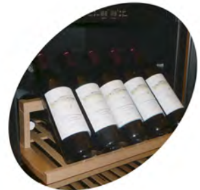
Presentation shelves available as option