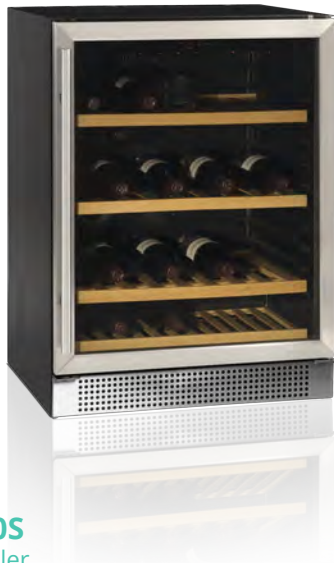
TFW160S Wine Cooler