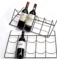
Presentation shelves available as option