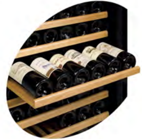
Wooden drawing shelves