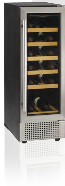
TFW80S Wine Cooler